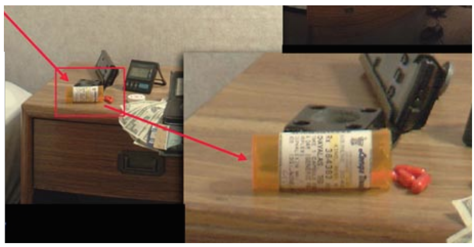
Pic. 2. Example of close-up and mid-range distance photos