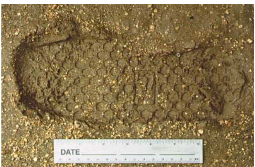
Pic. 3. Example of close-up of the detail, including a ruler