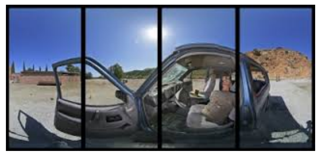
Pic. 1. Example of establishing photo composed by individual panoramic shots with overlap

overview of the scene. This allows investigators/judges to reconstruct the circumstances of the crimes as accurately as possible. If possible, include a marker indicating which direction is north to record the geographical location of the scene as accurately as possible.<sup>94</sup>